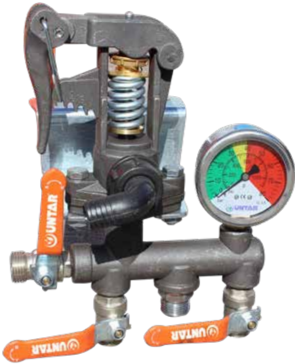
Pumps And Regulators M-50 REGULATOR