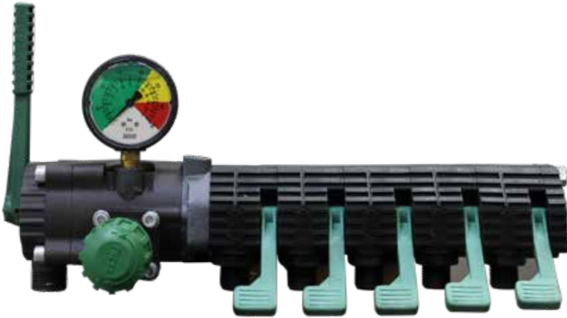
Pumps And Regulators NRS-50