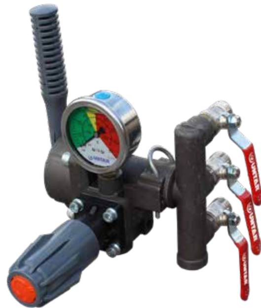
Pumps And Regulators VDR-50 3 WAYS REGULATOR