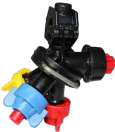
Nozzles Anti-Drip Three Ways Nozzle