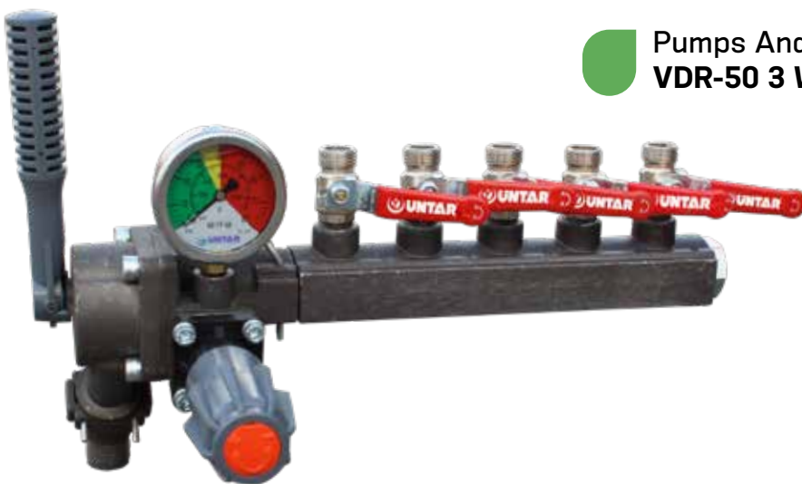
Pumps And Regulators VDR-50 5 WAYS REGULATOR