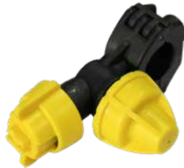
Nozzles Anti-Drip One Ways Nozzle