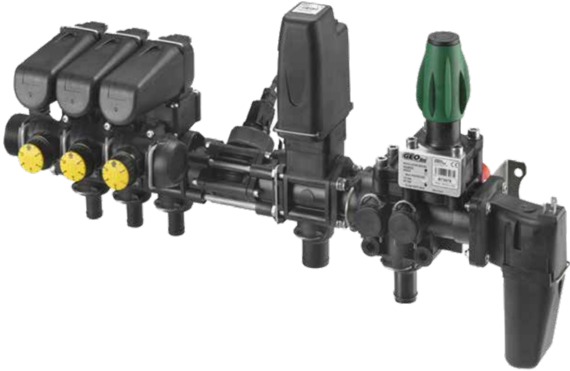
1- Tecomec GeoNave 30