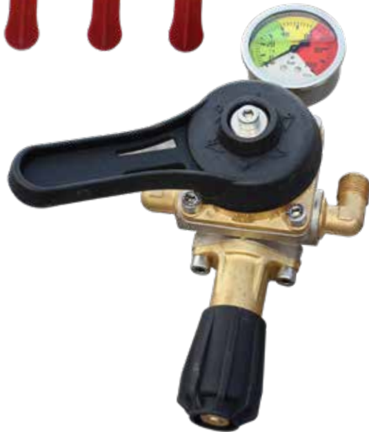
Pumps And Regulators BY-50 REGULATOR