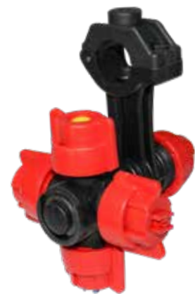
Nozzles Anti-Drip Four Ways Nozzle