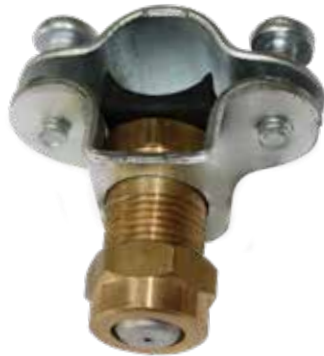
Nozzles Long Brass Nozzle