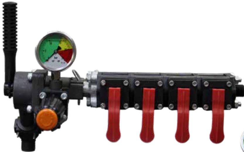
Pumps And Regulators NRS-50-R