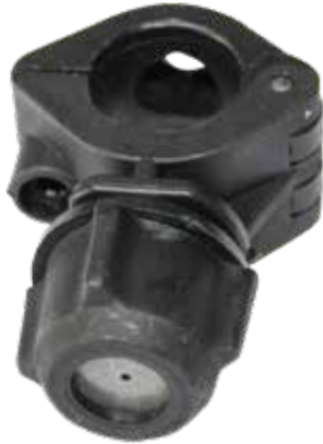
Nozzles Plastic Nozzle