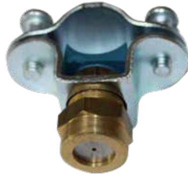
Nozzles Brass Nozzle